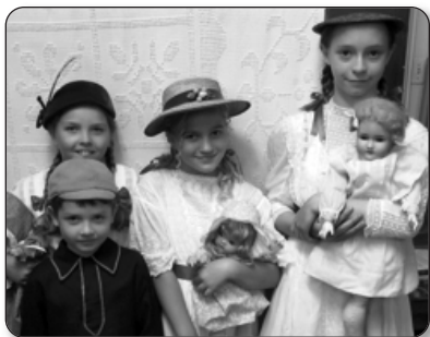
FoF Youth Performers

The Friends of Fashion will not perform during Strawberry Festival but are excited about presenting their new historical show at the Chassell Heritage Center, July 30, Sunday afternoon at 2:00, sharing the rich history of Portage Entry . We will share the stories and struggles about “Life in a fishing village” as early as the 1870’s. Here several Finnish families came together, making their living by fishing on the Superior Waters. In our presentation you will learn about the “Keweenaw Waterway” and how it made an impact on their lives, some of them were even skilled in boat building. You will have fun visiting the time period when “White City” was in its hay-day sporting a hotel, saloon, and dance pavilion. There one could ride a roller coaster or merry-go-round for five cents. Beautiful excursion boats transported guests to and fro for fifty cents round trip from Hancock or Houghton. On the trip out they passed the historic Messner Farm so we threw in a little history of their buildings.